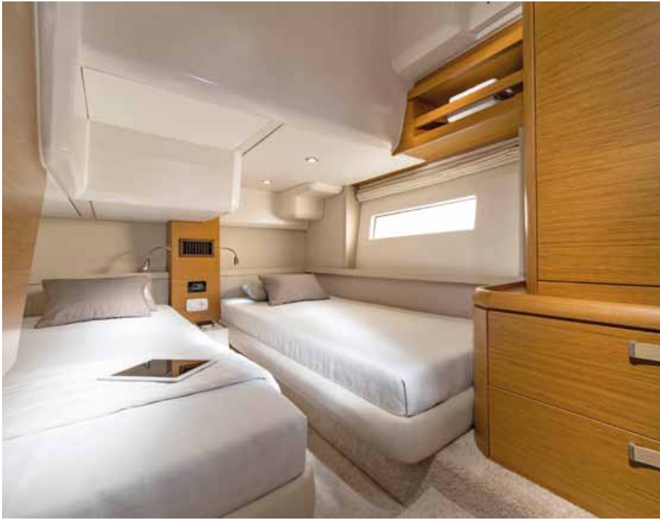
Two luxurious guest cabins with own bathroom