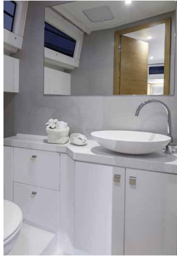
Separate owner's toilet and shower